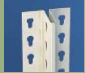
ZTP Intermediate Upright Post