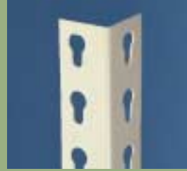
EUR Standard Upright Post