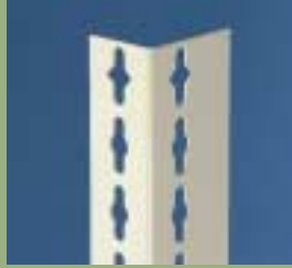
HUR Heavy Upright Post

Match posts with your needs: Use HUR posts for your most demanding applications. Use EUR for light or medium weight applications and in conjunction with ZTP posts. Use ZTP as an intermediate common "T" post.