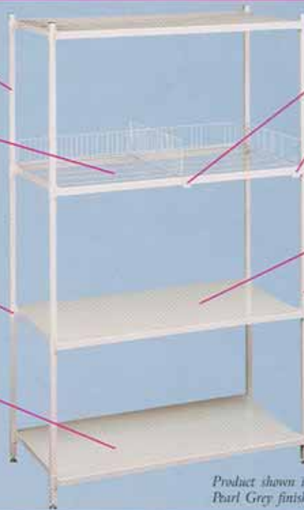
Product shown in Pearl Grey finish.

Our patented clip design allows shelves to be added, removed, or repositioned as quickly as your needs change without disturbing other shelving levels.